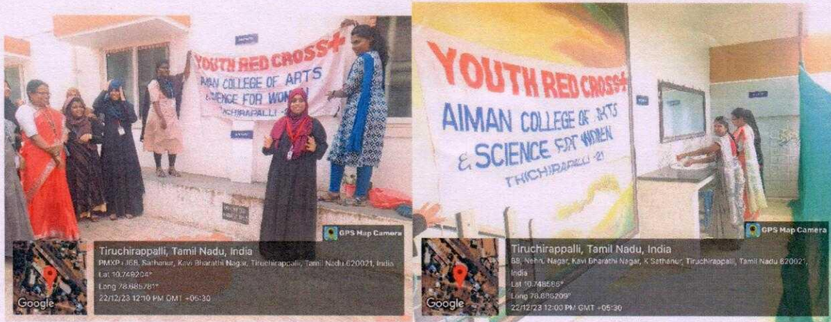
YRC Volunteers explain the water conservation